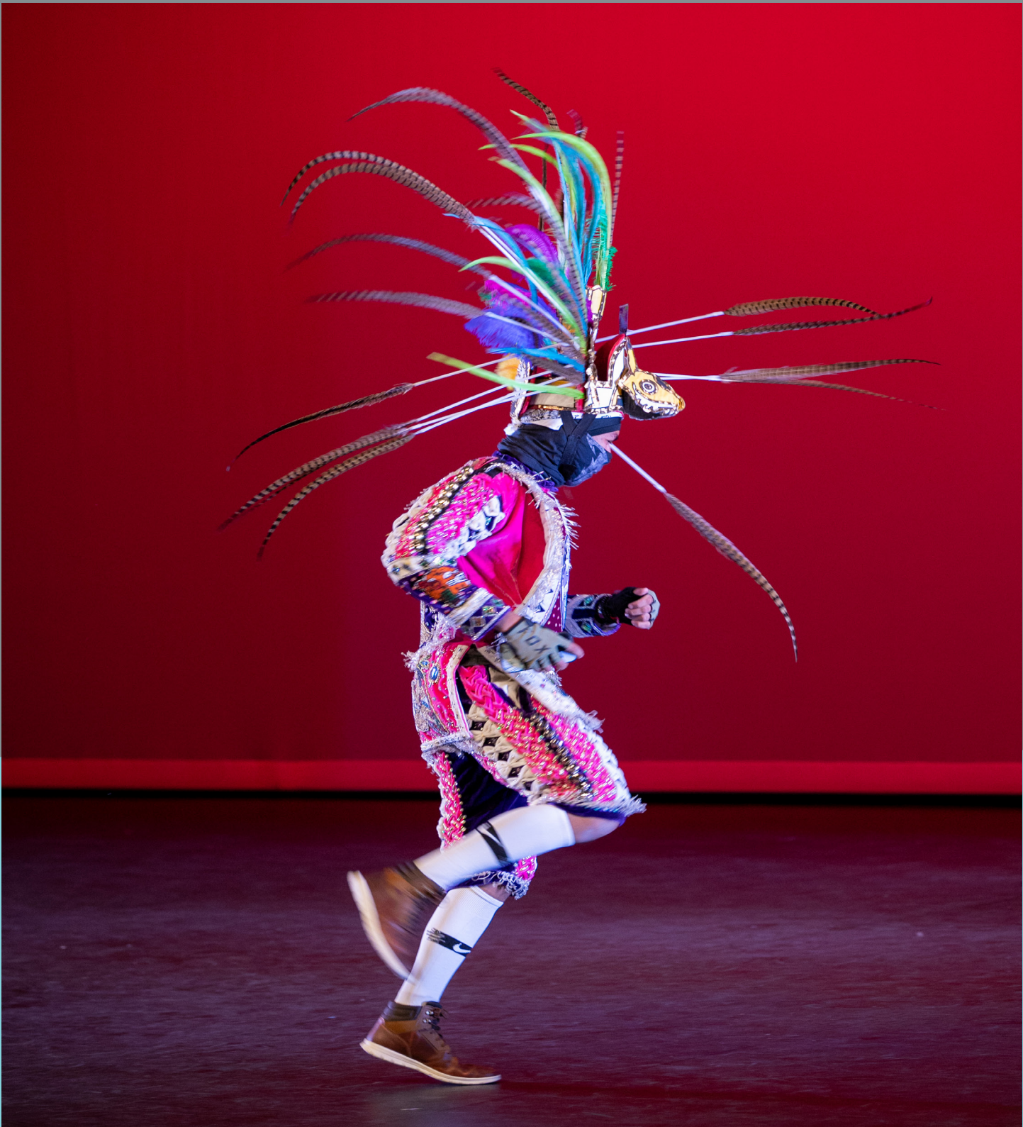
Tlaxacala Celebration, Community Center for the Arts

Wyoming Cultural Trust Fund 2301 Central Avenue Cheyenne, WY 82002 307-777-6312 wyoculturaltrust.com renee.bovey@wyo.gov