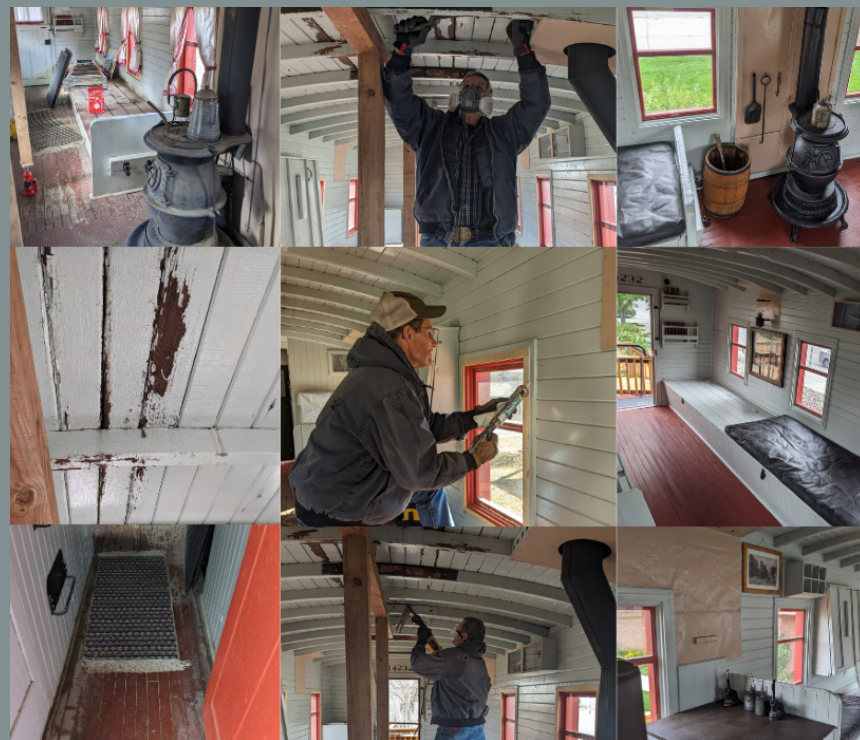
The Greybull Wyoming Museum Association, with the assistance of a WCTF grant, has worked to restore their 1900 era Burlington Caboose. This Caboose has been on prominent display at the Greybull Museum since the early 1990s and was in desperate need of roof repair, restoration of the interior to original specifications and installing an egress stairway and addition of an ADA-compliant ramp.